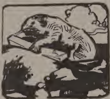
He Worked Busily.

“I SUPPOSE,” said daddy, “the most industrious and capable little animal is the beaver, for he can even help grownup men. When men are about to build bridges and they see that beavers are near by they are delighted, for they know beavers enjoy working and will help them greatly with the bridge building, and they’re such a little animal, too, that it is really wonderful how much they can do.